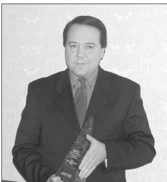
Citizen of the Year Congressman Pat Tiberi