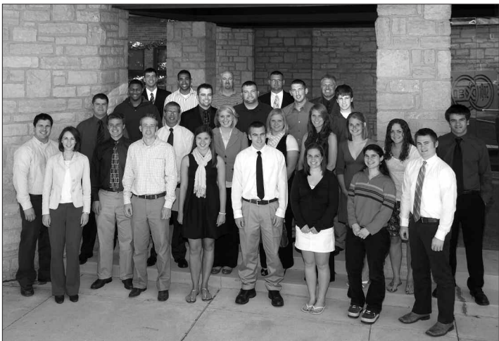
Your student could be pictured here! 2009-2010 BX scholarship award recipients pose for a photo prior to receiving their awards.

The BX Scholarship Program gave away tens of thousands of dollars last year, and is getting ready to do it again.