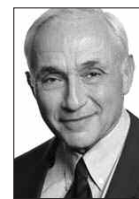
Leslie Wexner, Founder of Limited Brands

To kick off our new Leadership Legacies series, Columbus business icon Les Wexner tells his personal story of starting the Limited. Wexner is a perfect person to launch this exciting new leadership series, which will showcase extraordinary Central Ohio businessmen and women.